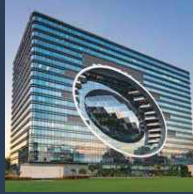
The Capital, BKC